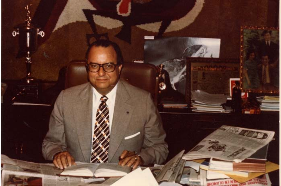
President Anastasio Garcia Somoza