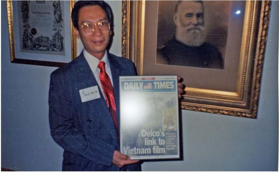
David Taus in 2002