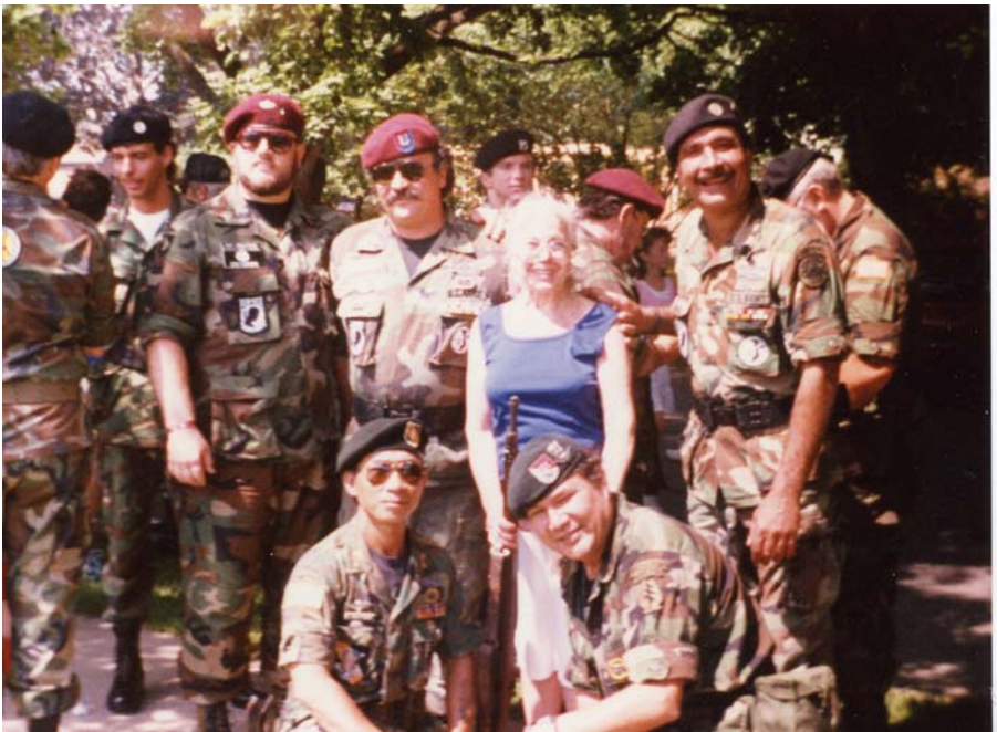
Yolanda Taus Memorial Day Parade, Rockville Centre, New York 1985