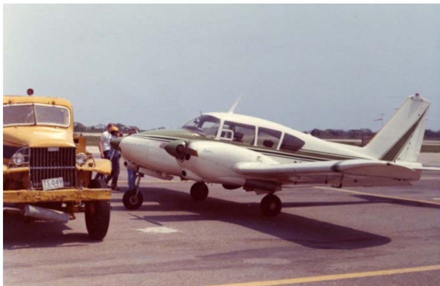
Refueling Piper Aztec during Central America trip

“Not quite, my young man,” counseled Sanchez. “There is a split personality here within U.S. capitalism. Nowadays we look for stability in these countries because our economic interests are there. A revolution creates instability. We don't know what the rebels will do if they win. After all, the dictators have supported U.S. capital interests. We feel the revolutionaries will target both the regime and the U.S. which supported the government.”